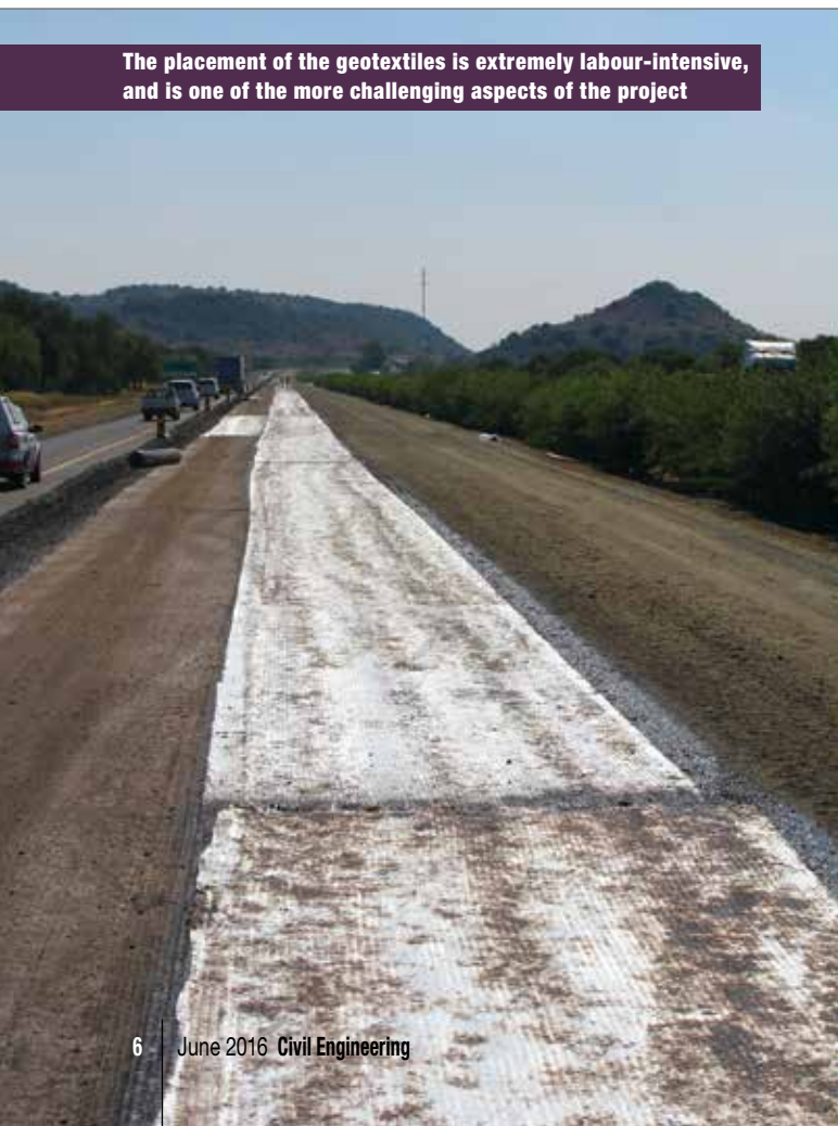
The placement of the geotextiles is extremely labour-intensive, and is one of the more challenging aspects of the project

He says the project has been divided into 16 sections, each about four kilometres in length. Work starts with the measurement of the natural ground levels, followed by the milling of 50 mm of the base of the existing pavement. This milled material is being used to produce the 20% of recycled asphalt used in the BTB that is being batched by Much Asphalt as part of SANRAL's ongoing focus on sustainable road construction.