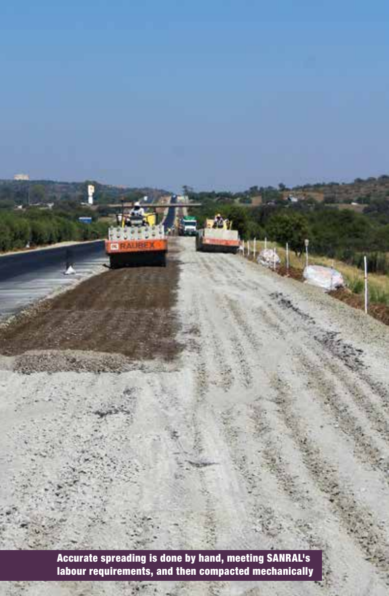
Accurate spreading is done by hand, meeting SANRAL's labour requirements, and then compacted mechanically